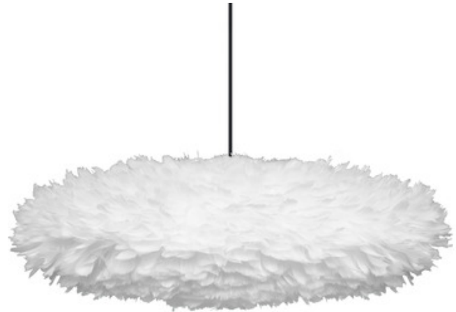
Shown in: Black / White

The Eos Esther Pendant draws its shape and mesmerizing beauty from the earth tones of the Nordic landscape. Made from authentic goose feathers, each carefully positioned on a paper core by hand. It radiates a cozy and pleasant glow. Routine cleaning is easily done with a hairdryer.