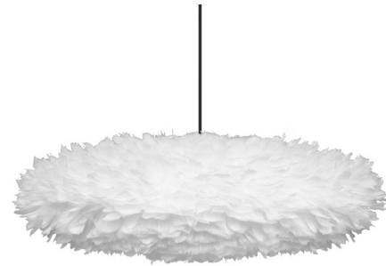
Shown in black / white

The Eos Esther Pendant draws its shape and mesmerizing beauty from the earth tones of the Nordic landscape. Made from authentic goose feathers, each carefully positioned on a paper core by hand. It radiates a cozy and pleasant glow. Routine cleaning is easily done with a hairdryer.