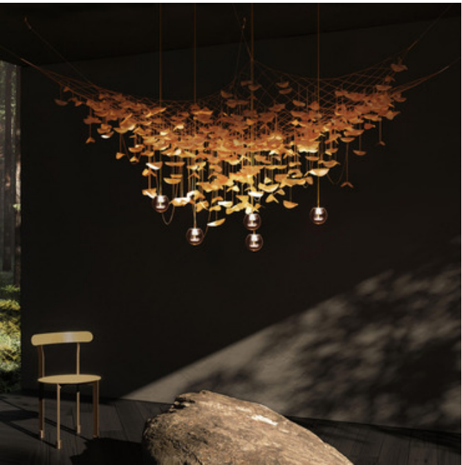
Shown in: Brushed Gold / Alabaster White

Part of the Automne Collection by Larose Guyon, the Valse au Crepuscule Suspension draws from, and gives back to, nature. An exquisite celebration of nature in all its splendor and its inimitable wonders, Automne is a collection that highlights the intricate compositions of elemental forms. Otherworldly, the delicate and the bold, imbued with artistic vision and elevated with noble materials, strike a chord of timeless luxury and refinement. With this ethereal collection, design, nature, and skill collide to create three exclusive sculptural works of 16 limited edition pieces that fuse art with function and evoke the delicate art form of sublime jewelry. Meticulously handcrafted, each design is painstakingly brought to life with unparalleled mastery and ingenuity for a breathtaking mesmeric result. Crafted of the finest materials - Brushed 24K Gold plated solid brass, brass fiber leaves and gold plated solid brass chains with Alabaster White glass shades. Larose Guyon is committed to allocating a portion of its profits to planting 1000 trees for each purchase of the Automne collection. That means a total of 50,000 trees will be planted once the collection is sold out. Each owner of Larose Guyon's Automne collection will be able to decide where the trees will be planted, in one of the many parts of the world where One Tree Planted is active. Larose Guyon will provide official documents certifying that One Tree Planted has completed the work.