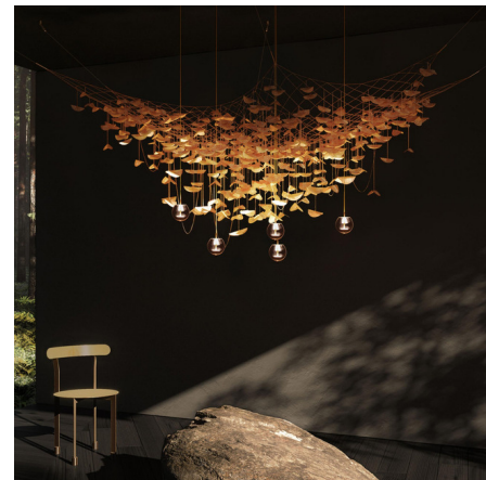
Shown in brushed gold / alabaster white

PRODUCT DIMENSIONS . . . . . Overall Height: Specified upon ordering LAMP COLOR . . . . . 2200K