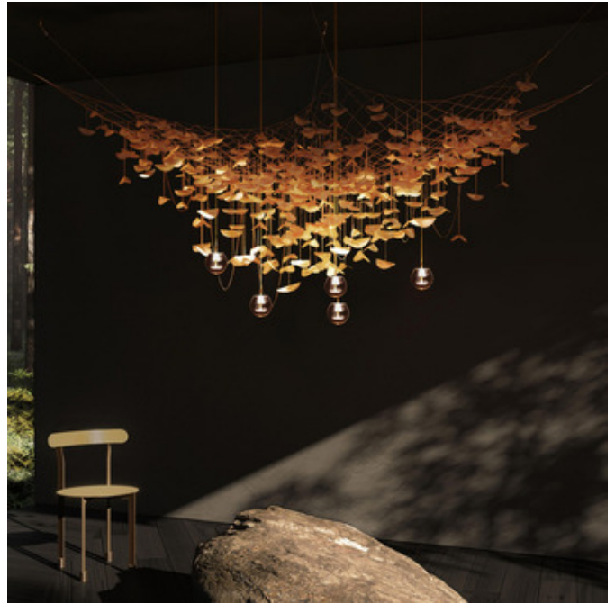
Shown in: Brushed Gold / Alabaster White

Part of the Automne Collection by Larose Guyon, the Valse au Crepuscule Suspension draws from, and gives back to, nature. An exquisite celebration of nature in all its splendor and its inimitable wonders, Automne is a collection that highlights the intricate compositions of elemental forms. Otherworldly, the delicate and the bold, imbued with artistic vision and elevated with noble materials, strike a chord of timeless luxury and refinement. With this ethereal collection, design, nature, and skill collide to create three exclusive sculptural works of 16 limited edition pieces that fuse art with function and evoke the delicate art form of sublime jewelry. Meticulously handcrafted, each design is painstakingly brought to life with unparalleled mastery and ingenuity for a breathtaking mesmerizing result. Crafted of the finest materials - Brushed 24K Gold plated solid brass, brass fiber leaves and gold plated solid brass chains with Alabaster White glass shades. Larose Guyon is committed to allocating a portion of its profits to planting 1000 trees for each purchase of the Automne collection. That means a total of 50,000 trees will be planted once the collection is sold out. Each owner of Larose Guyon's Automne collection will be able to decide where the trees will be planted, in one of the many parts of the world where One Tree Planted is active. Larose Guyon will provide official documents certifying that One Tree Planted has completed the work.