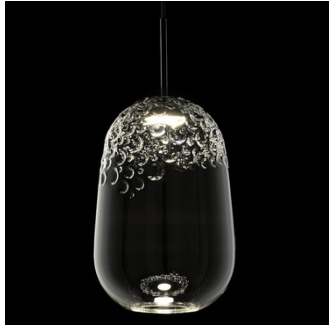
Shown in: Black / Clear

The Galuchat Pendant features a Transparent hand-blown glass shade with an opaque anthracite metal painted frame. The precious handwork made it possible to obtain an irregular texture reminiscent of the manufacturing of shark-tanned leather, also called galuchat from the name of its first user, Jean-Claude Galuchat, a French craftsman at the service of King Louis XV. Made in Italy. Note: A remote dimmable power supply can be purchased separately below.