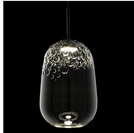
Shown in dark grey / clear

The Galuchat Pendant features a transparent hand-blown glass shade with an opaque anthracite metal painted frame. The precious handwork made it possible to obtain an irregular texture reminiscent of the manufacturing of shark-tanned leather, also called galuchat from the name of its first user, Jean-Claude Galuchat, a French craftsman at the service of King Louis XV. Made in Italy. Includes non-dimmable driver.