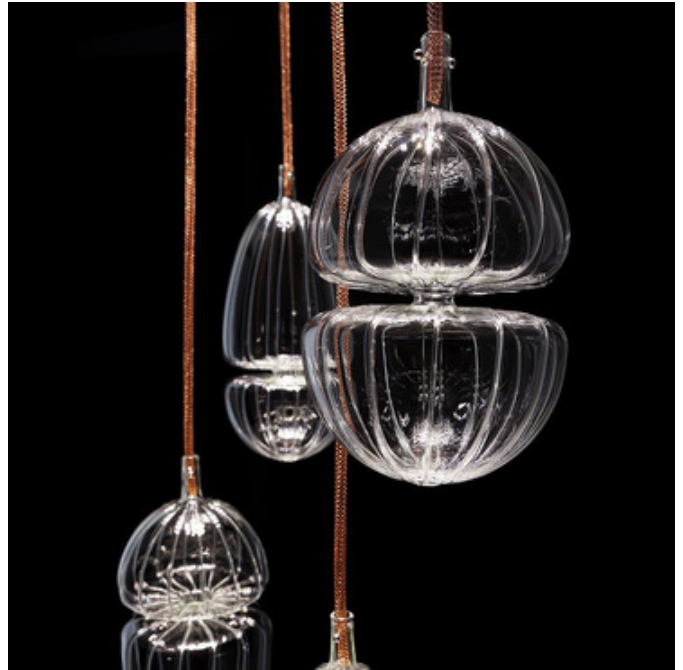
Shown in: Brown Mesh / Clear

Part of the Hydra Collection, the Acorn Pendant lives with a simplicity dancing between design and applied art. Available with Clear or Frosted ruled blown glass and a choice of four shapes. Each pendant includes one metallic mesh cord in a variety of hues. The glass pendant itself is not illuminated. An illuminated multi-port canopy or recessed lighting system is required for illumination, sold separately. Acorn suspensions look most striking when placed in a group. Handmade in Italy.