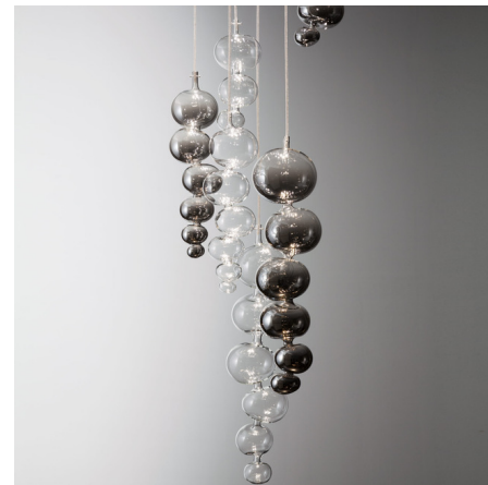
Shown in silver mesh / transparent

Part of the Hydra Collection, the Organic Suspension dismantles the principles of symmetry and regularity that represent the collection's essence. Available in three sizes of handblown Clear or Metallic glass. Each pendant includes a metallic mesh cord in a variety of hues. The glass pendant itself is not illuminated. An illuminated multi-port canopy or recessed lighting system is required for illumination, sold separately. With Organic it is possible to create countless light configurations suitable for all architectural interiors. Organic suspensions look most striking when placed in a group. Handmade in Italy.