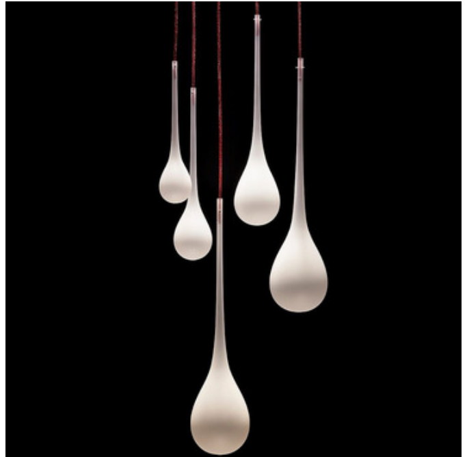
Shown in: Brown Mesh / Frosted

Part of the Hydra Collection, the drop-like Sigma Pendant lives with a simplicity dancing between design and applied art. Available with a Frosted or Transparent handblown glass shade and a metallic mesh cord in a variety of colors. The glass pendant itself is not illuminated. An illuminated multi-port canopy, inner light element, or recessed lighting system is required for illumination, sold separately. With Sigma it is possible to create countless light configurations suitable for all architectural interiors. Sigma suspensions look most striking when placed in a group. Handmade in Italy.