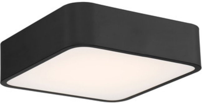
Shown in: Black / Acrylic

Add a sleek, geometric element to modern interiors with the Granada LED Flush Mount by Access Lighting. In spaces with lower ceilings, this flush mount provides ample ambient light as well as a well-designed focal. Point. It features a round-cornered square frame made out of steel, with a light-diffusing acrylic bottom diffuser.