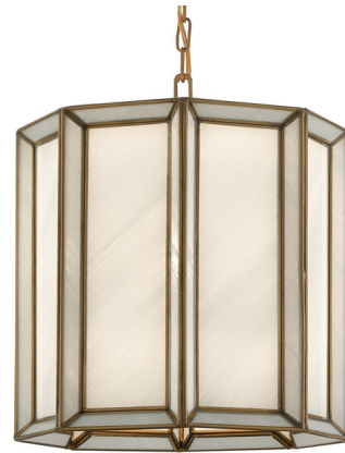
Shown in antique brass / opal

The Daze Pendant is made of articulated panels of White Milk Glass that are joined together by ribs of Metal in an Antique Brass finish. This Daze will turn luminous when it is switched on.