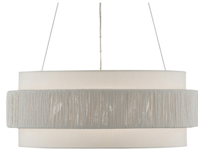
Shown in white / beige

PRODUCT DIMENSIONS . . . . . Adjustable Height: 25" to 144.5"