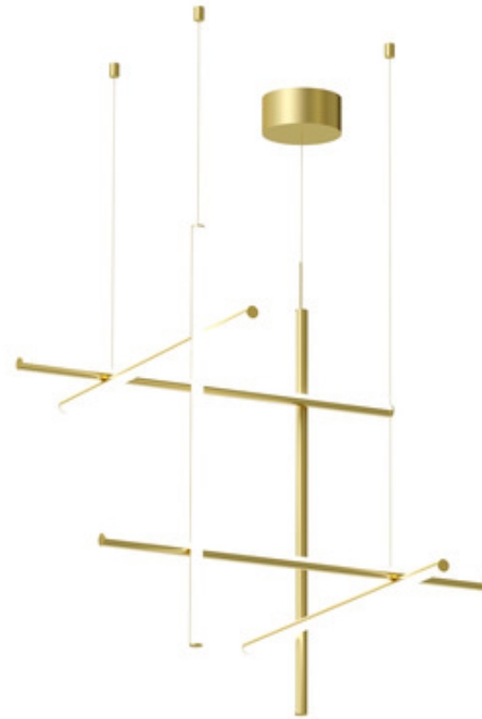
Shown in: Champagne / Opal

The Coordinates Pendant is a sleek illuminated grid of strip lights, a sculptural design suspended on unobtrusive electrified cables to achieve a floating effect. Each element is made of extruded anodized aluminum and is fitted with an integrated LED strip and platinum optical silicone diffuser. Hanging height is adjustable. Install this striking piece in contemporary residential and commercial spaces to create dramatic impact. This pendant is available in four compositions (S1, S2, S3, S4) as well as the Module S option which is designed for use in multiples to create large grids for custom installations. The canopy contains the driver and mounts on a standard junction box. Dimmable with a 0-10V dimmer.