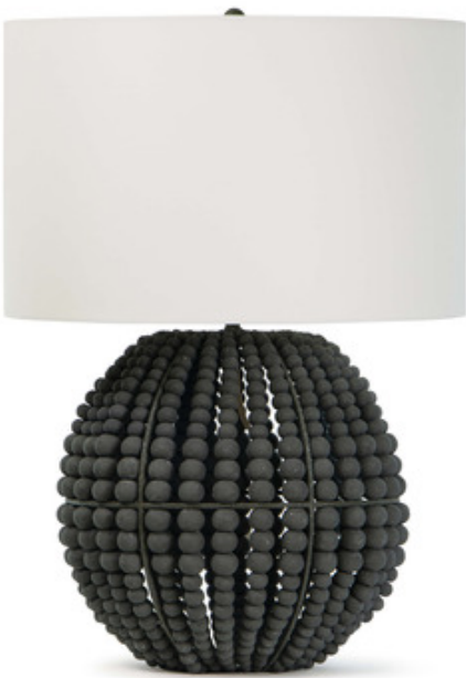
Shown in: Charcoal / White

The Tropez Table Lamp exemplifies the coastal style through its materials and airy design. Wooden Birch beads, finished in a Dark Charcoal, dress up the Tropez's steel structure while a White Drum shade completes the glamour. Place in the living room, dining room or bedroom. UL listed.