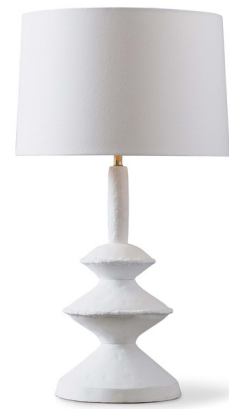
Shown in matte white / white

PRODUCT DIMENSIONS . . . . . Cord Length: 96"