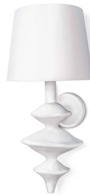
Shown in white / natural linen

PRODUCT DIMENSIONS . . . . . Backplate: 4.5" x 4.5"