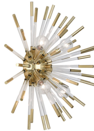
Shown in modern brass

PRODUCT DIMENSIONS . . . . . Backplate: 4.75"Dia.