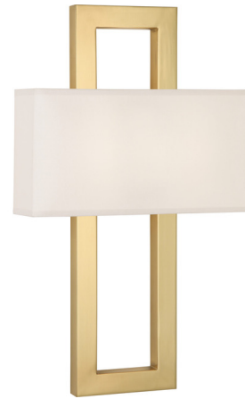
Shown in antique brass / snowflake

PRODUCT DIMENSIONS . . . . . Backplate: Rectangle, 4.375"W x 5"H x 0.5"D