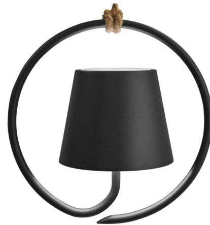
Shown in graphite

COLOR RENDERING 80 CRI LAMP COLOR CCT Select LUMENS/WATT 116.36 LUMINOUS FLUX 256 lumens