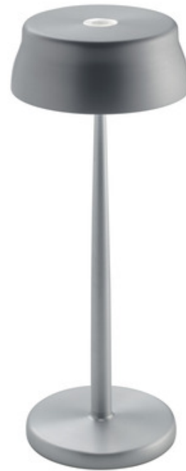
Shown in: Anodized Aluminum

The Sister Cordless Table Lamp is a clean, modern piece that fits in with a range of home styles. Made of die-cast aluminum, this sleek beauty is rechargeable and portable. The thin body is flanked by a matching, rounded base and shade. The shade contains an integrated LED that emits a clean and full glow, one that's perfect for accenting the room. 58-hour battery life after a full charge. Switch between 2700, 3350, 4000K color temperatures. Suitable for indoor and outdoor use. Includes charging cable with USB-C input.