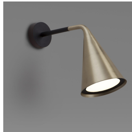
Shown in matte black / brushed brass

The Gordon Wall Sconce has a formal and material interpretation of the conical diffuser that is the main feature of the Gordon product line from Tooy. Adjustable direct light 270 degrees. Available in three sizes with a Matte Black finish complemented by a Black, Polished Gold, Black Chrome, or Brushed Brass colored shade. Includes 4.5 inch diameter cover plate for US junction box. CE Listed.