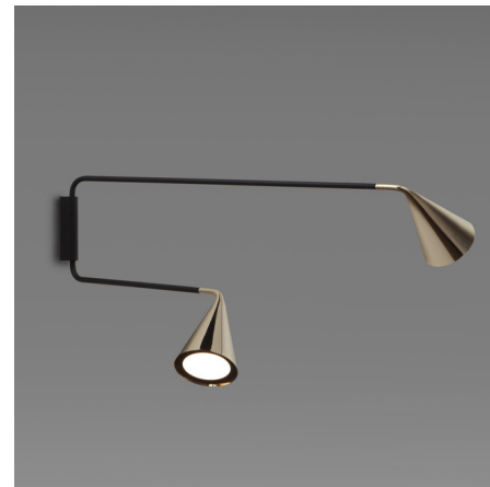
Shown in matte black / polished gold

The Gordon Double Adjustable Wall Light has a formal and material interpretation of the conical diffuser that is the main feature of the Gordon product line from Tooy. Two adjustable cones extend from the Gordon's centerpoint and provide ample lighting for both tasks and ambience. Adjustable direct light 270 degrees. Available with a Matte Black finish complemented by a variety of shade colors. Includes canopy to cover standard U.S. junction box (not shown in image).