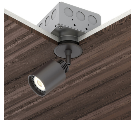
Shown in satin nickel

The Vanishing Point Millwork Plaster-In Fast Jack 12V Rebel head in Satin Nickel finish features a slight outline of the 2 inch round canopy that it mounts to. Includes a 120-12VAC electronic low voltage (ELV) power supply. Canopy may be painted over to hide 2 inch round outline of canopy, but would need to be repainted if power supply needs to be replaced. 1 inch stem length. Maximum 9 watt 12 volt GU5.3 MR16 LED, sold separately. 90 degree tilt/360 degree rotation. ETL listed. Suitable for damp locations. Title 24 compliant. Optional optical accessories sold separately. Product is built to order. Note: Image shown in discontinued Antique Bronze finish.