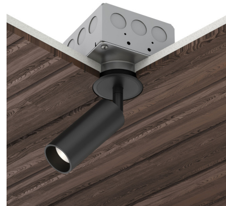
Shown in black

The Vanishing Point Millwork Fast Jack 24V Tubo Head with integrated LED features a 2 inch canopy which sits flush in millwork ceilings. Available in two sizes. Includes a 120-24VAC electronic low voltage (ELV) power supply. Available in five color temperature options including Warm Dim (3000K-1800K) with 20, 40 or 60 degree beam angle options. Die cast aluminum with finish in Black. 90 degree tilt/360 degree rotation. ETL listed. Title 24 compliant. Product is built to order. NOTE: TUBO SMALL NOT AVAILABLE IN NARROW FLOOD BEAM ANGLE OPTION.