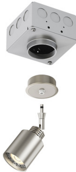
Shown in: Satin Nickel

The Vanishing Point Millwork Fast Jack 12V Rebel head with integrated LED features a 2 inch canopy which sits flush in millwork ceilings. Requires a 120-12V remote power supply, sold separately. Spun brass with finish in Satin Nickel. 1 inch stem length. Maximum 9 watt 12 volt GU5.3 MR16 LED, sold separately. 90 degree tilt/360 degree rotation. ETL listed. Suitable for damp locations. Title 24 compliant. Required 12VDC electronic low voltage (ELV) or 150 watt or 300 watt magnetic low voltage (MLV) remote power supply and optional accessories sold separately. Product is built to order.