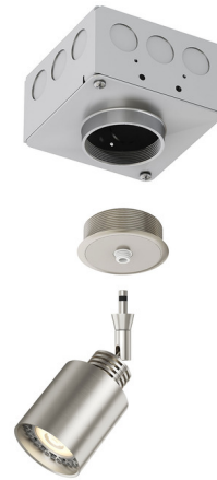
Shown in satin nickel