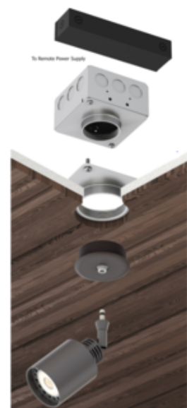
V2MR Vanishing Point 2" Flush Canopy for Millwork with Remote power supply