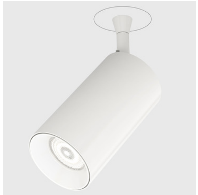
Shown in: White

The Vanishing Point Drywall Plaster-In Fast Jack 12V Piston Head with integrated LED features a slight outline of the 2 inch round canopy that it mounts to. Includes a 120-12VAC electronic low voltage (ELV) power supply. Canopy may be painted over to hide 2 inch round outline of canopy, but would need to be repainted if power supply needs to be replaced. Available in two color temperatures with a field adjustable single optical reflector in 15, 25, 35 or 45 degree beam angle options. Die cast aluminum with finish in White or Black. 1 inch stem length. 90 degree tilt/360 degree rotation. ETL listed. Suitable for damp locations. Title 24 compliant. Product is built to order.