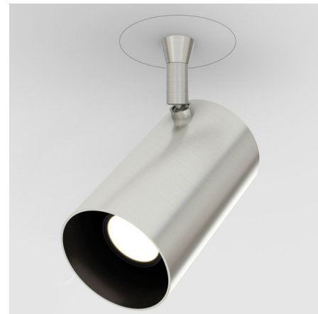
Shown in satin nickel

LAMP LIFE . . . . . 60000 hours BEAM ANGLE . . . . . 25° COLOR RENDERING . . . . . 92 CRI LAMP COLOR . . . . . 3000K LUMENS/WATT . . . . . 40.00 LUMINOUS FLUX . . . . . 360 lumens