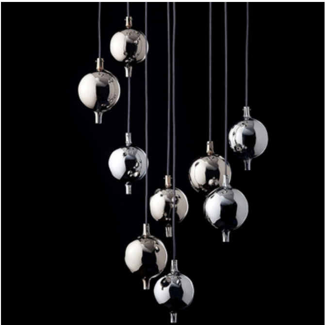
Shown in: Brown Mesh / Metallic

Part of the Hydra Collection, the Berry Pendant lives with a simplicity dancing between design and applied art. Available with a Clear or Metallic handblown glass shade and a metallic mesh cord in a variety of hues. The glass pendant itself is not illuminated. An illuminated multi-port canopy, inner light element, or recessed lighting system is required for illumination, sold separately. With Berry it is possible to create countless light configurations suitable for all architectural interiors. Berry suspensions look most striking when placed in a group. Handmade in Italy.