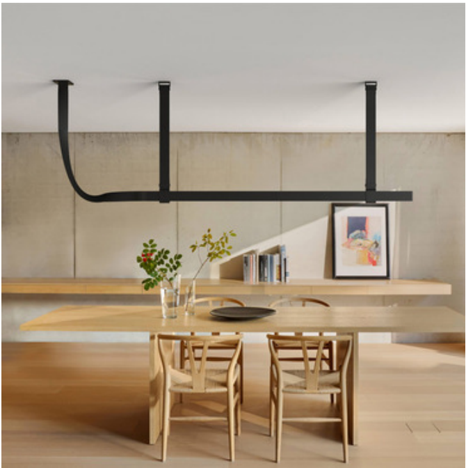
Shown in: Black Leather

LIGHTOLOGY EXCLUSIVEThe Belt Linear Pendant is a technical pendant that is covered in fine leather that is sewn to measure and integrates all composition elements. This fixture was developed to achieve a sinuous line without apparent interruptions. A soft part hangs from the ceiling and conceals the electrical network while the rigid part conceals the light source which provides direct and indirect illumination. Includes remote power supply. Independent user dimming control of the uplight and downlight. Dimming with integrated Casambi controller inside the fixture controllable using the Flos control app free to download from Google Play and Apple App store. Available with a Black Leather, Green Leather, or Natural Leather finish that includes the straps and metal clasps that act as hooks on the ceiling. UL listed.For new construction applications only.