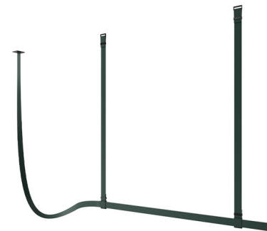
Shown in green leather

COLOR RENDERING . . . . . 95 CRI LAMP COLOR . . . . . 2700K LUMENS/WATT . . . . . 33.81 LUMINOUS FLUX . . . . . 1961 lumens