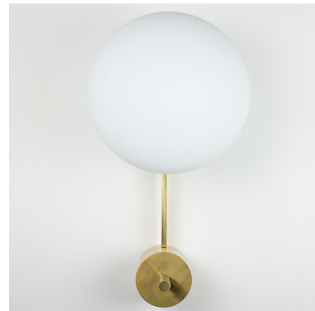
Shown in unpolished balanced brass / opal

The Stella Baby brings elegance to midcentury design through the inspiration of Italian designer Angelo Lelli. A handmade Brass body is arranged linearly to display a single opaque Murano glass globe. Once illuminated, the Stella Baby shines with luster and instantly adds sophisticated ambiance to your space. Available with a Brass, Blackened, Bronze, Chromed Lucid, Chromed Opaque, Polished, Polished Brushed, Unpolished Balanced, Unpolished Balanced, and Unpolished Opaque finish. Handmade in Italy. UL listed.