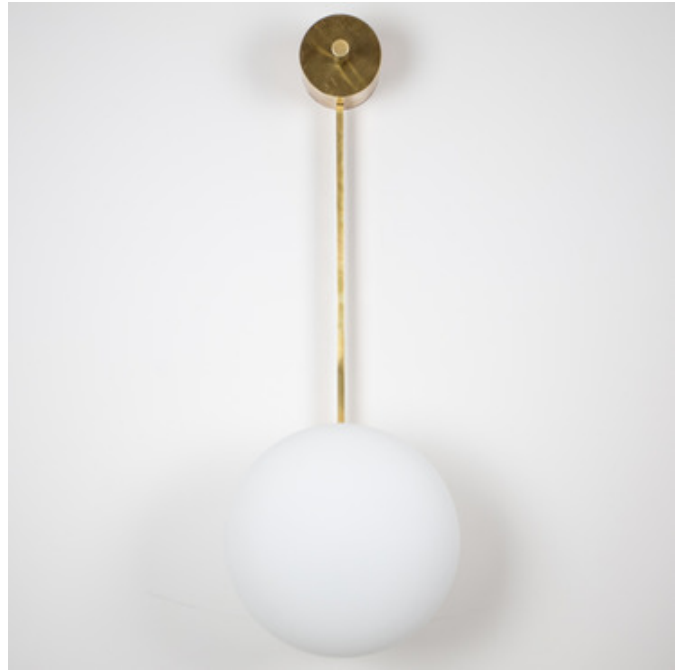
Shown in: Unpolished Balanced Brass / Opal

The Stella Angel brings elegance to midcentury design through the inspiration of Italian designer Angelo Lelli. A handmade Brass body is arranged linearly to display a single opaque Murano glass globe. Once illuminated, the Stella Angel shines with luster and instantly adds sophisticated ambiance to your space. Available with a Brass, Blackened, Bronze, Chromed Lucid, Chromed Opaque, Polished, Polished Brushed, Unpolished Balanced, Unpolished Balanced, and Unpolished Opaque finish. Handmade in Italy. UL listed.