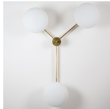
Shown in unpolished balanced brass / opal

The Stella Triennale brings elegance to midcentury design through the inspiration of Italian designer Angelo Lelli. A handmade Brass body is arranged in an innovative pattern to display a collection of opaque Murano glass globes. Once illuminated, the Stella Triennale shines with luster and instantly adds sophisticated ambiance to your space. Available with a Brass, Blackened, Bronze, Chromed Lucid, Chromed Opaque, Polished, Polished Brushed, Unpolished Balanced, Unpolished Lucid, and Unpolished Opaque finish. Handmade in Italy. UL listed.