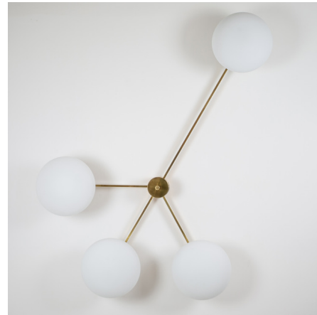
Shown in unpolished balanced brass / opal

The Stella Love brings elegance to midcentury design through the inspiration of Italian designer Angelo Lelli. A handmade Brass body is arranged in an innovative pattern to display a collection of opaque Murano glass globes. Once illuminated, the Stella Love shines with luster and instantly adds sophisticated ambiance to your space. Available with a Brass, Blackened, Bronze, Chromed Lucid, Chromed Opaque, Polished, Polished Brushed, Unpolished Balanced, Unpolished Balanced, and Unpolished Opaque finish. Handmade in Italy. UL listed.