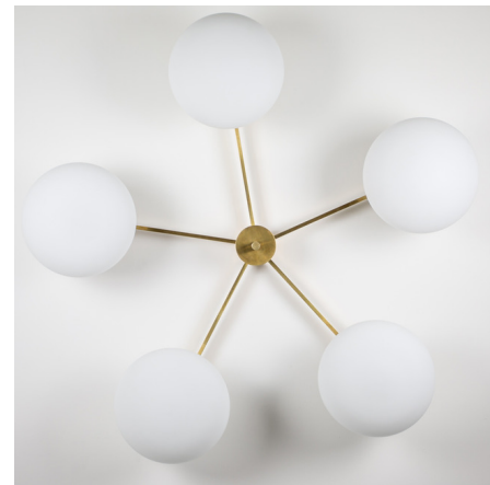
Shown in unpolished balanced brass / opal

The Stella Daisy brings elegance to midcentury design through the inspiration of Italian designer Angelo Lelli. A handmade Brass body is arranged in an innovative pattern to display a collection of opaque Murano glass globes. Once illuminated, the Stella Daisy shines with luster and instantly adds sophisticated ambiance to your space. Available with a Brass, Blackened, Bronze, Chromed Lucid, Chromed Opaque, Polished, Polished Brushed, Unpolished Balanced, Unpolished Balanced, and Unpolished Opaque finish. Handmade in Italy. UL listed.