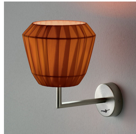
Shown in satin nickel / red brick plisse

The Loto Wall Sconce with Switch brings grace and beauty to your space with its pleated fabric shade stretched over an open metal frame. When lit, the frame can be seen, adding another visual dimension to your interior space. On/Off switch is located on the backplate. May be mounted with the shade up or down.