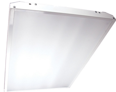
Shown in white / frosted

The LED Linear High Bay features a steel frame with no scalloping and pop riveted and rounded edge corners, a wide beam spread, and a frosted lens for glare control. Available in two color temperatures and three wattages. Available with or without battery backup or motion sensors. Quick to install. Includes a 2 Tong Hangers, a 5' Jack Chains, a Hub Mount Kit for 3/4 conduit/ Stem Mount, 6-Foot Pre-wired Cord. DLC v4.4 Premium. UL listed for damp location.