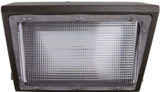
Shown in: Bronze / Transparent

The Non-Cutoff LED Wall Pack features a Die-cast aluminum housing, an impact resistant prismatic polycarbonate lens, and a durable dark bronze powder coat finish. Has the same footprint as existing HID wall packs. Available with or without photocell in two different wattages and at two different color temperatures. DLC v4.3 Standard. RoHS Compliant. UL listed for wet location.