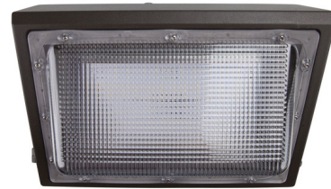
Shown in bronze / transparent

The Non-Cutoff LED Wall Pack features a Die-cast aluminum housing, an impact resistant prismatic polycarbonate lens, and a durable dark bronze powder coat finish. Has the same footprint as existing HID wall packs. Available with or without photocell in two different wattages and at two different color temperatures. DLC v4.3 Standard. RoHS Compliant. UL listed for wet location.