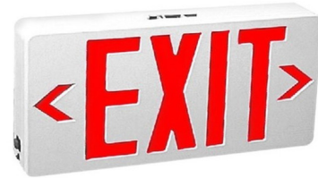
Shown in white / red

The Compact Polycarbonate Exit Sign features an injection-molded thermoplastic ABS housing, a 24 hour recharge after 90 minute discharge, and a Ni-Cd battery. AC only. Universal. Available with Red lettering with or without battery backup. Also available with green lettering WITHOUT BATTERY BACKUP ONLY. Meets NFPA 101. ETL listed for damp location.