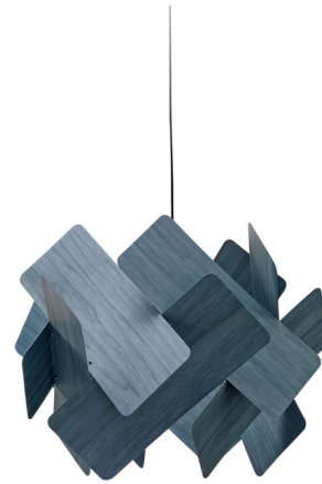
Shown in black / blue

The Escape Pendant is an avant garde pendant with a smart domino like structure. Its self-supporting veneer panels give the impression of falling into a ring of light, their form defying gravity. While enjoying a little bit of swagger and appearing fairly pleased with itself, the Escape pendant's manner is bright and buoyant. Available in a variety of wood veneer shades, and finished in Matte Black metal canopy and cord, White metal canopy and cord, or Nickel metal canopy and transparent cord.