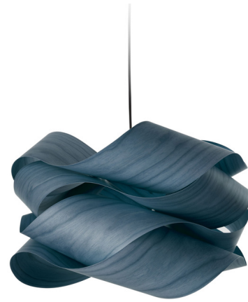
Shown in matte black / blue

The Link Suspension appears exceptionally dashing in its stacked wood veneer Mobius strips. In mathematics, the Mobius strip is a surface with one continuous side, meaning the Link light is not only handsome, but discerning too. With its billowy, cloud-like structure, Link is decidedly easy on the eye. Punctiliously crafted, the lamp's floating form is a clever illustration of wood's significant potential in lighting design. Canopy: 4.5 inch diameter CANOPY & CABLE FINISHES - Matte Black / Black Cable - WH - Matte White / White Cable - NI - Nickel / Transparent Cable