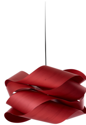
Shown in matte black / red

PRODUCT DIMENSIONS . . . . . Adjustable Cable Length: 96"