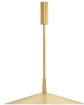
Shown in satin brass / satin brass