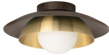
Shown in bronze / satin brass

The Carapace Surface Mount is a modern re-interpretation of a 1920s light. Hand-spun metal shades finished in Bronze and Satin Brass surround an Opal glass shade that diffuses the light evenly. Holes in the brass spinning allow light to glow within the bronze spinning creating a warm glow.