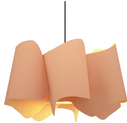
Shown in black / rose / ash