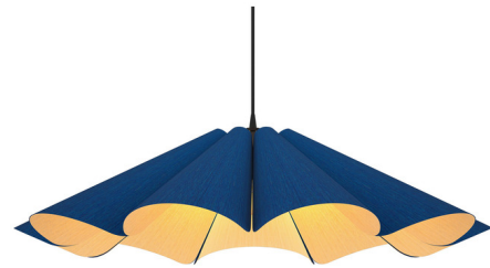
Shown in black / blue outer / ash inner

PRODUCT DIMENSIONS . . . . . Adjustable Cable Length: 108"