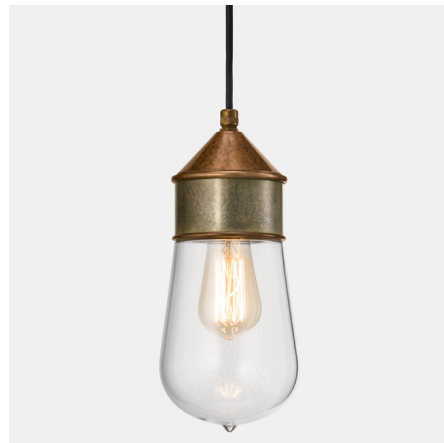
Shown in brass / clear

The Drop I Pendant brings an industrial vibe through its craftsmanship and materials. Constructed of Copper and Brass, the Drop's look is capped off with a clear Glass shade that adds an extra layer of tension to the piece. Classic and contemporary, the Drop works well in a number of interiors. Includes canopy for US installation. UL listed.