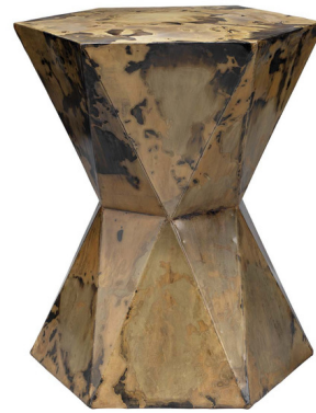
Shown in acid washed

The Crown Side Table is the stunning result when metallic sheet metal meets geometric angles. A lustrous patina graces the Crown's surface and adds to its visual impact. Its prismatic shape features flat facets and clean straight lines that feel cosmic, yet rustic in nature. Its camouflage-like patina has a shiny finish that highlights its flat geometric facets. The perfect blend of rustic alloy elements with a sleek modern design. Available in two sizes.