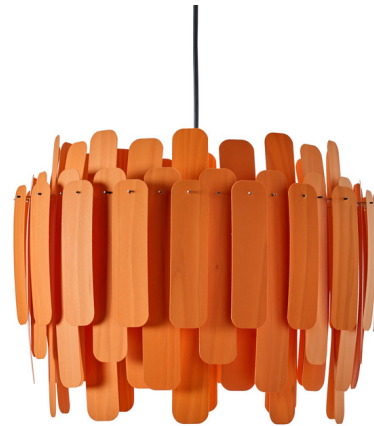
Shown in matte black / orange wood

The Maruja Pendant is both strong and feminine, unfussy and decorative. Its bold design will be perfect in a variety of styles. This do it yourself lamp comes with all components and is easy to assemble. Wood veneer strips in several sizes, a circular frame, and pins. Maruja is easily constructed, without the need for any tools or adhesives. Using a pin, each wooden strip is clipped onto the circular frame. Insert a light bulb, and you will have created your perfect piece. The wood veneer strips hang and move freely. Available with a Matte Black canopy and black cable, Matte White canopy and white cable, or Brushed Nickel canopy with transparent cable. Assembly required.