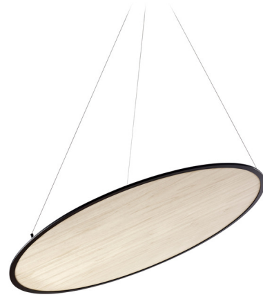
Shown in black / ivory white

The Suns Hanging Sound Panel, designed by Mikiya Kobayashi, is a decorative celestial panel that breaks sound and diffuses the natural light in your space. The circular Ivor White Wood veneer panel has the respectful beauty that is inherent in Japanese quality. Designed to hang at an angle, Suns is striking alone or in clusters. Available in three sizes. Includes three ceiling hooks and three 96 inch black cables. NOTE: This is not a lighted pendant, for decorative / sound diffusing purposes.