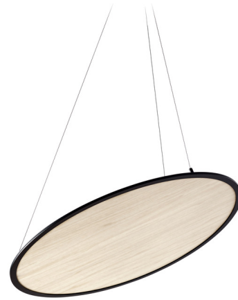
Shown in black / ivory white

PRODUCT DIMENSIONS . . . . . Adjustable Canle Length: 96"