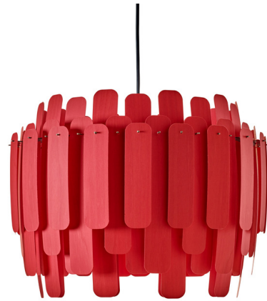
Shown in matte black / red